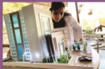
Interior Design Diploma/Degree