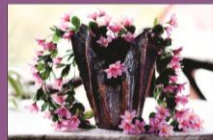
Fine Arts Diploma