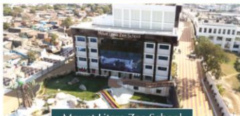
Mount Litera Zee School