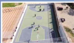
Basketball Court (with Synthetic Acrylic Flooring)