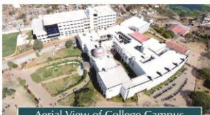
Aerial View of College Campus