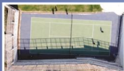
Lawn Tennis Court (Synthetic)