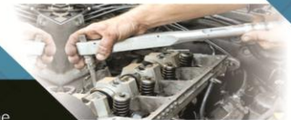
Diesel Mechanic 1 वर्षीय डिप्लोमा पाठ्यक्रम