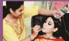
Makeup Artist Certified Course