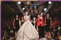
Fashion Design Diploma/Degree