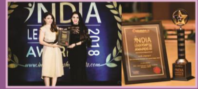
Awarded "Best Design Institute in Central India