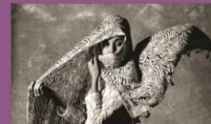
Photography Certified Course